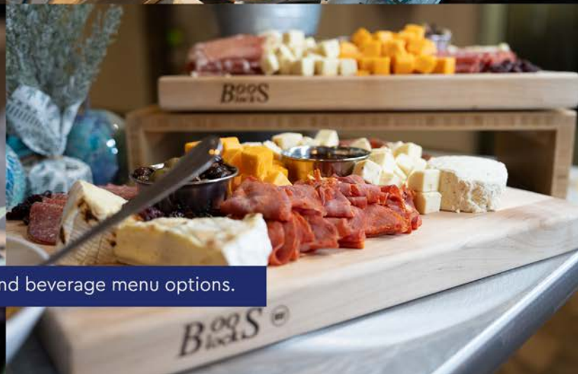
Premium, inclusive food and beverage menu options.